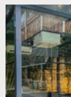
The TAJ Bangalore

Airport Lounges Bars Banquet Halls Barbeques Bakeries Casinos Disco Clubs Hookah Pubs Home Theaters Smoking Lounges Restaurants