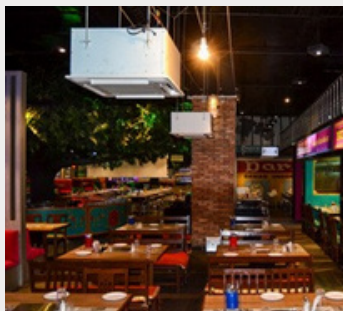
The Ohri's Hyderabad