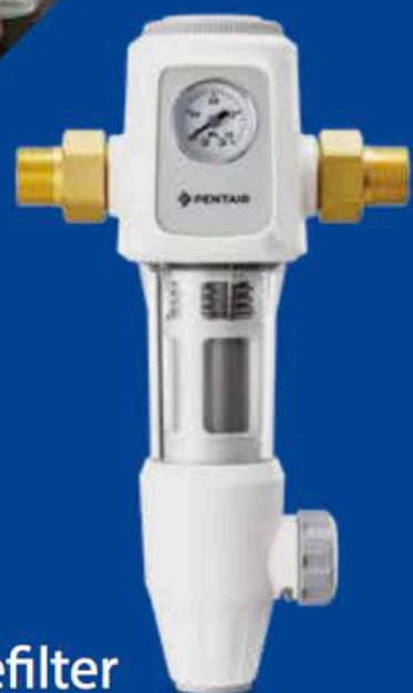
Pentair Backflush Prefilter