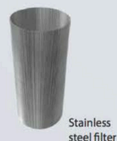
Stainless steel filter

*Filtered particles refer to pollutants larger than 40 microns.