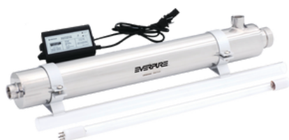
B: PFB-006 Ultraviolet Sterilizer