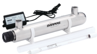
A: PFB-002 Ultraviolet Sterilizer