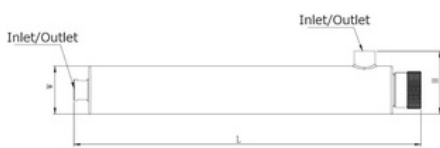
B: PFB-006 Ultraviolet Sterilizer