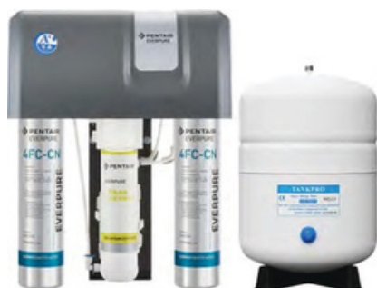
Everpure RO-200U Reverse Osmosis System

Efficient and flexible with blending for different food service applications